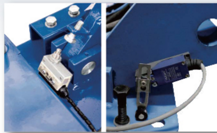
2 Upper & lower limit switches improve operator safety and lift longevity.