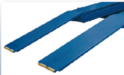
4 Ramp kit for surface installation.