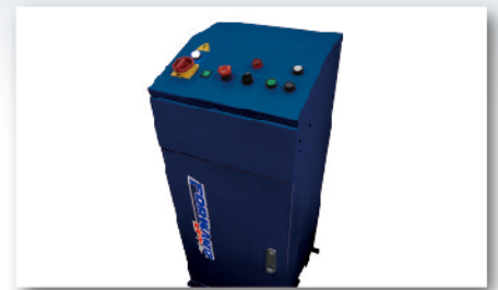
3 Control panel is easy to operate.