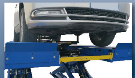
9 Optional cross beam CBK-ML50-4 minimizes tilt of the two runways while bias loading.