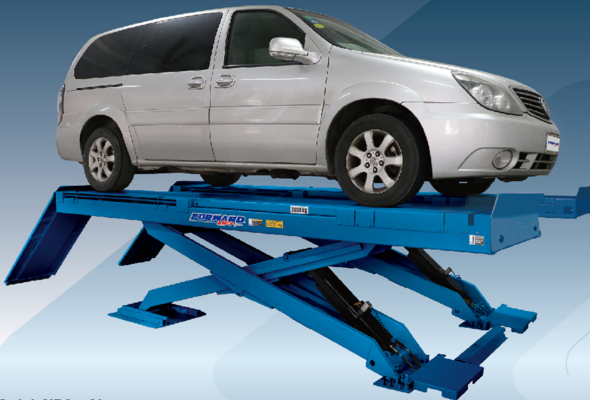
Shown Model: NBS40AL-45