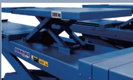
7 3000 kg capacity lifting table for NBS40AL-45 and NBS40AL-48.