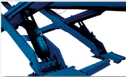
1 Advanced electro hydraulic operating system ensures safety and reliability.