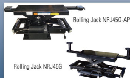
8 Optional rolling jack NRJ45G and NRJ45G-AP.